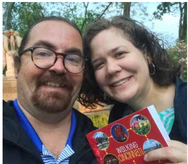
We have logged thousands of steps exploring our city and community on foot with this walking tour book!