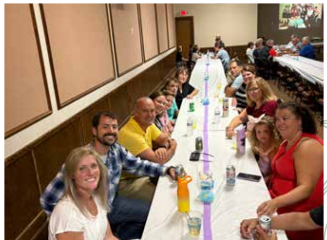
Extended family celebrating Jill's parent's 50th Anniversary