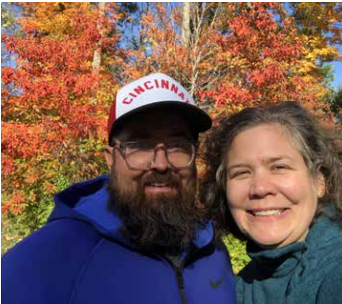
Enjoying a fall hike.