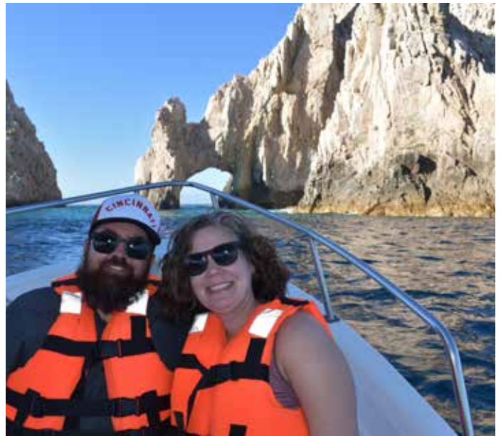
Whale watching with family in Cabo.