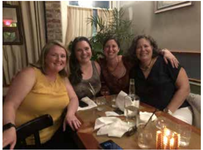
A delicious dinner with grad school friends

While much of our immediate family lives a few hours away, we stay closely connected. When we visit, we make the most of our time together—whether it's a long weekend celebrating holidays, gathering for birthdays, or spending a week at the beach with siblings, these moments help us stay rooted in one another's lives.