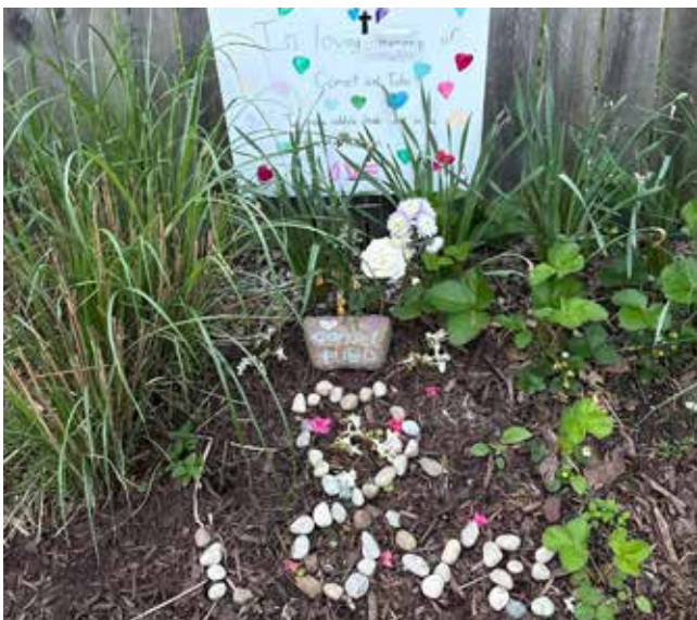
The neighborhood kids made a memorial for some wild bunnies that got caught in the cold.

For a child, our home and community will be a place to feel safe, supported, and surrounded by love—whether that's playing in the yard, joining us in the kitchen, or exploring the neighborhood and making friends.