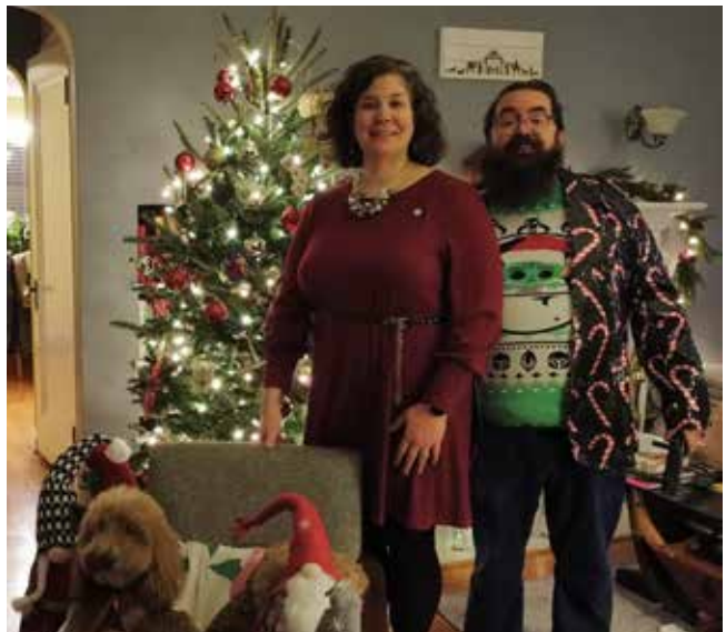
A holiday photo-always a challenge to get one where everyone looks good, but that's half the fun!