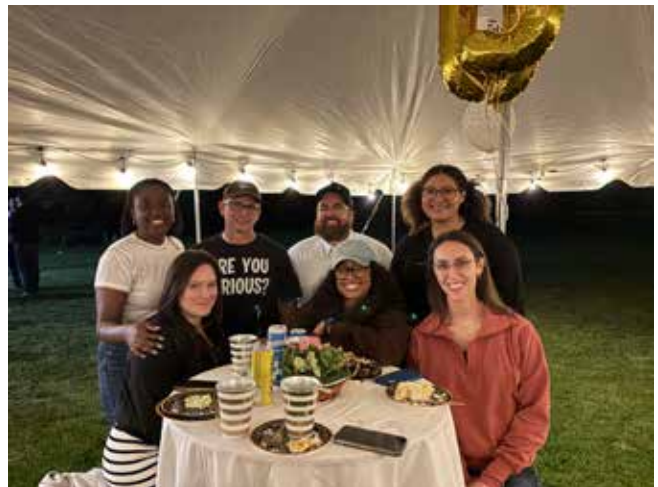
Celebrating a friend & colleague's birthday!