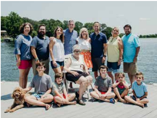
Fourth of July celebration