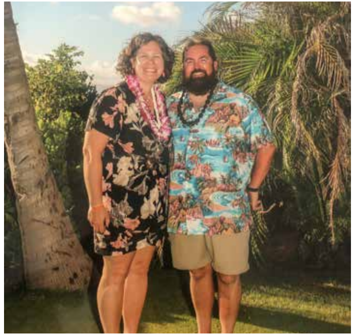
Anniversary trip to Hawaii