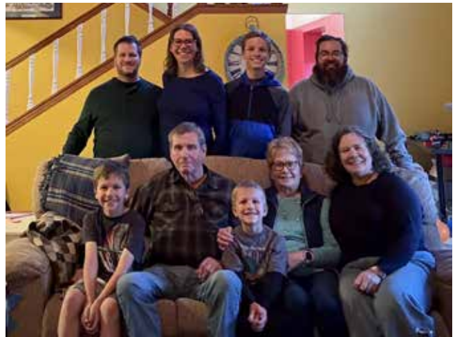
Celebrating fall birthdays