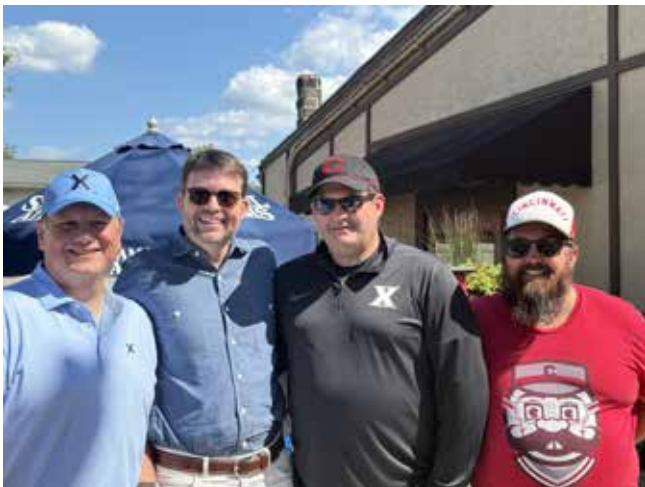
College friends in town for a visit!