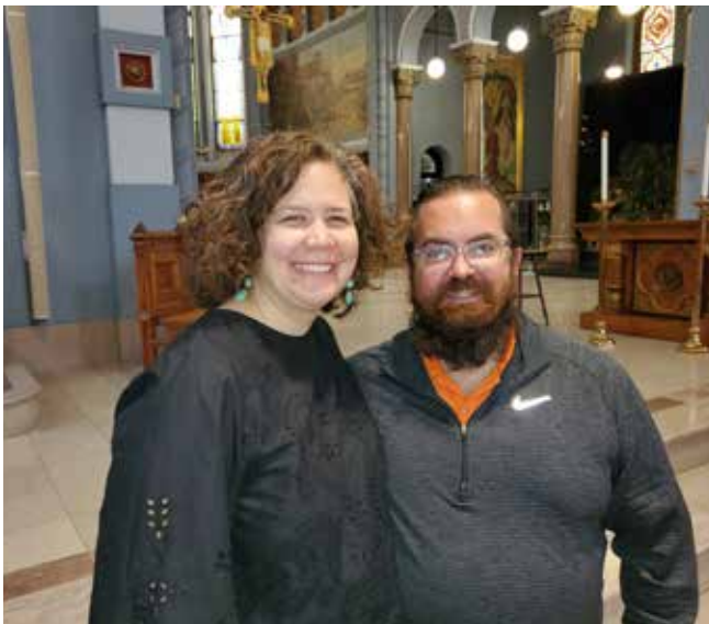
We have found an inclusive Catholic community that we love.

The Christmas season is one we particularly enjoy. We pick out a live Christmas tree for our home and decorate it with the ornaments we've collected from our travels and throughout our lives. When the decorating is done, we curl up on the couch to watch Muppet's Christmas Carol and drink hot chocolate. During the holiday season, Pat always makes sure we attend a local holiday parade that features dogs (and owners!) dressed up for the occasion, and we map out holiday light displays and spend an evening driving around, listening to Christmas music and enjoying the lights. We cherish the idea of opening Christmas gifts with our child and building on our family traditions.