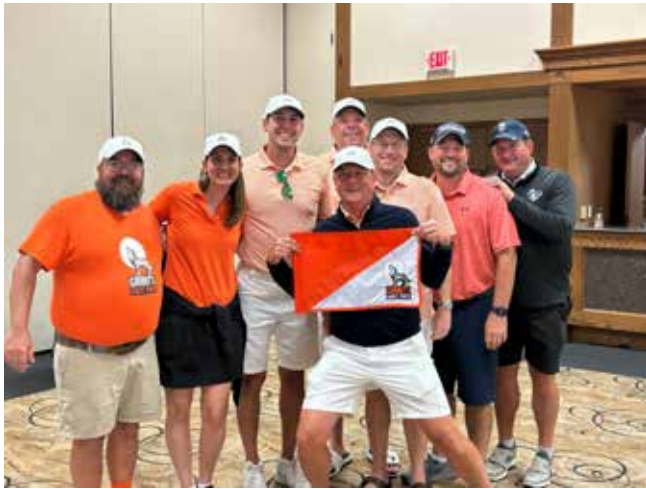
Annual golf outing