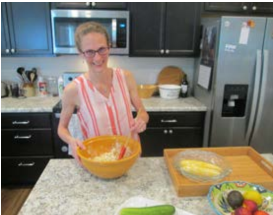
Fourth of July