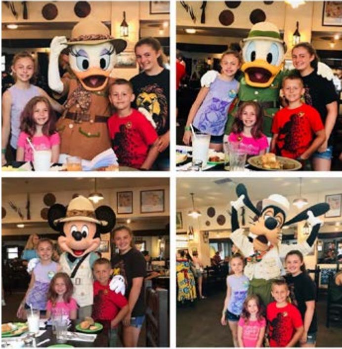
Fun at Disney World!