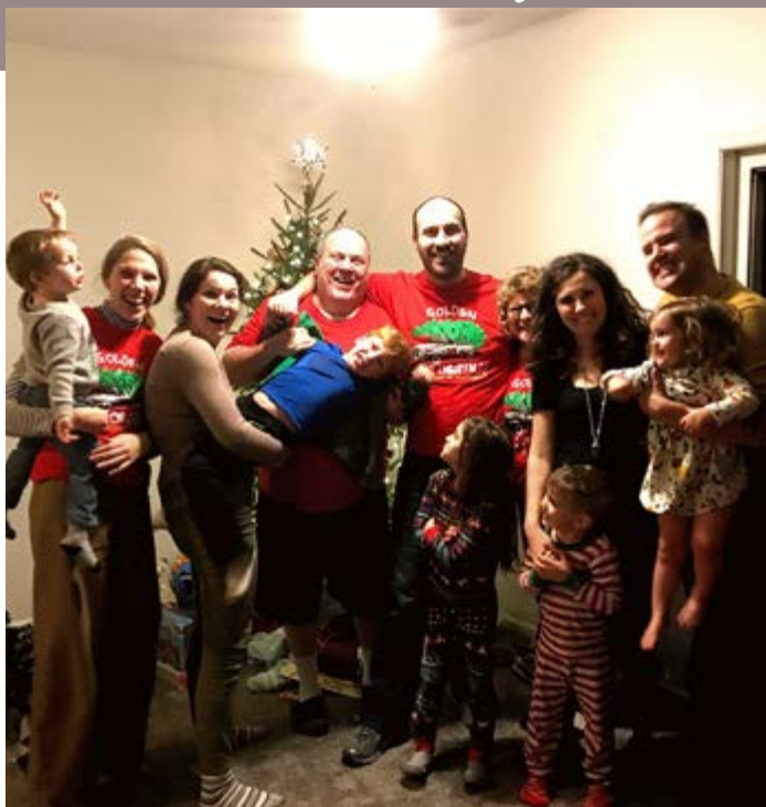
Holidays with Cousins!