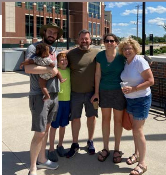
Family vacation to Wisconsin