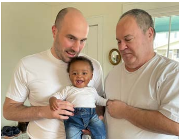
Three Generations Matching!