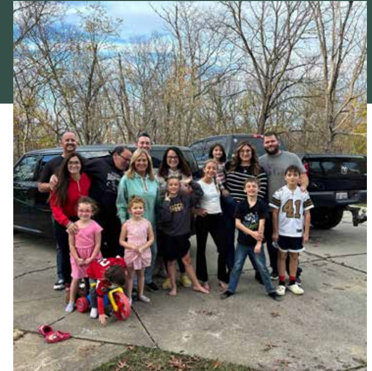
Family night at Robbie's big sister's house