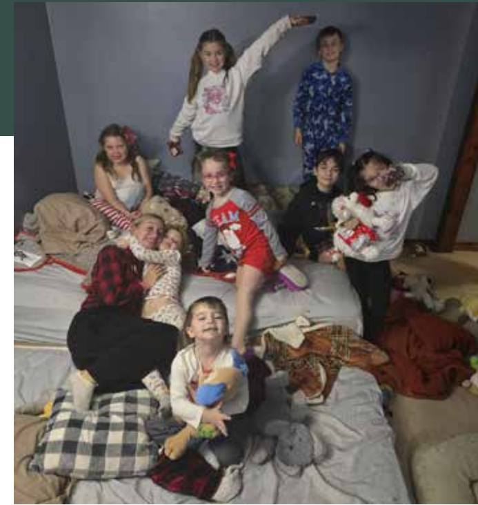
Nieces and nephew at the end of Christmas Fun Day 2024