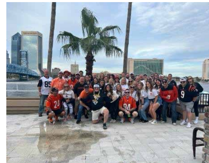
100 cousins going to see the Bengals game in Jacksonville, FL 2023