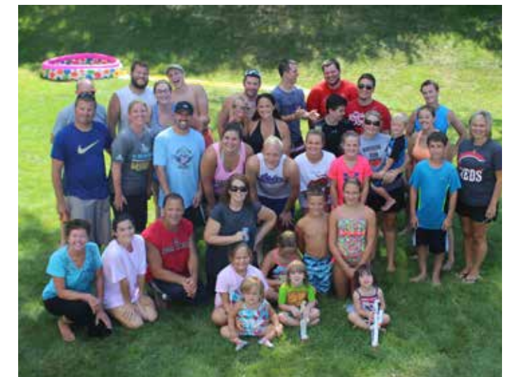
Cousins Day playing slip-n-slide kickball

Niki's immediate family and their spouses and kids!