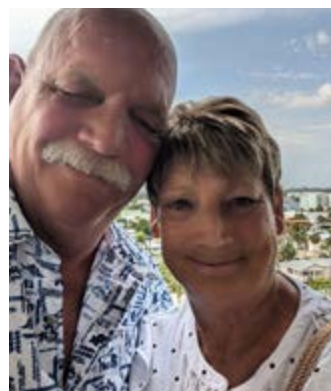
Allison's mom and step dad