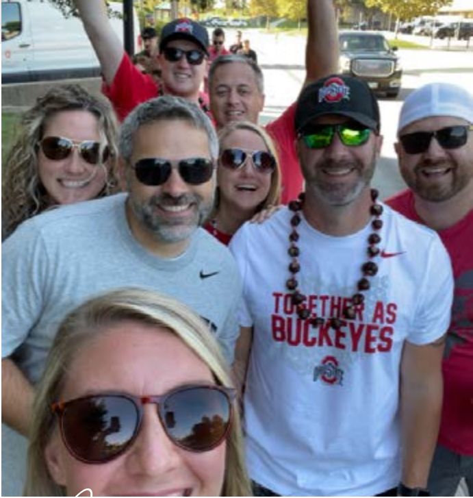
Going to the Buckeye game with friends and family!