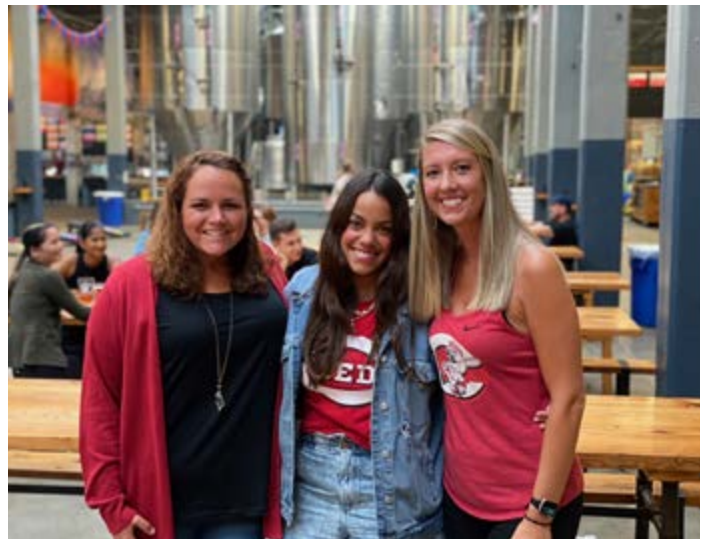
On our way to the Reds game!

"Family is family, whether it's the one you start out with the one you end up with, or the family you gain along the way."