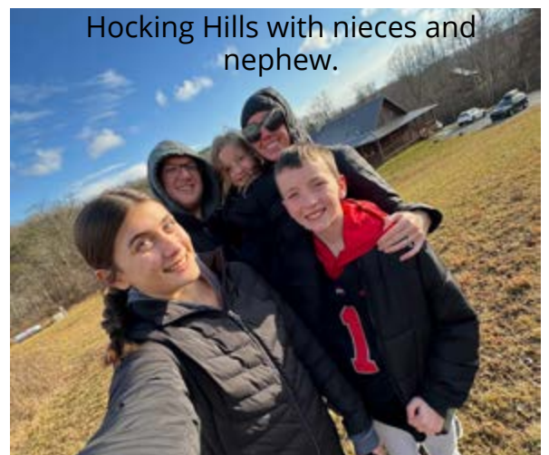
Hocking Hills with nieces and nephew.