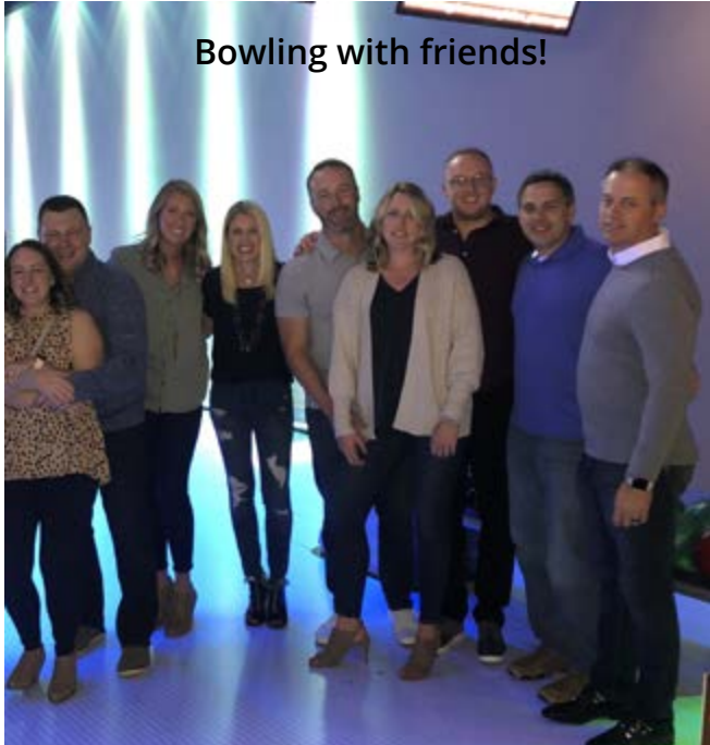
Bowling with friends!