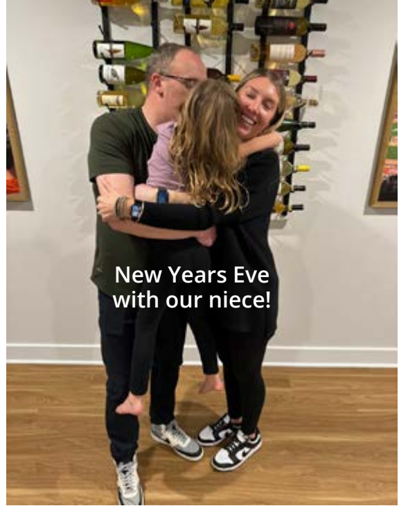
New Years Eve with our niece!

The things that make me happy and fill my cup to the brim are family time, concerts, traveling, cookouts, and experiencing new things from museums to restaurants. Quality time with my husband, extended family, nephew, and nieces is something that I value and make a top priority in my life. From going to the kiddos' sporting events to making dinner as a couple, this is what truly brings me solace, comfort, and joy!