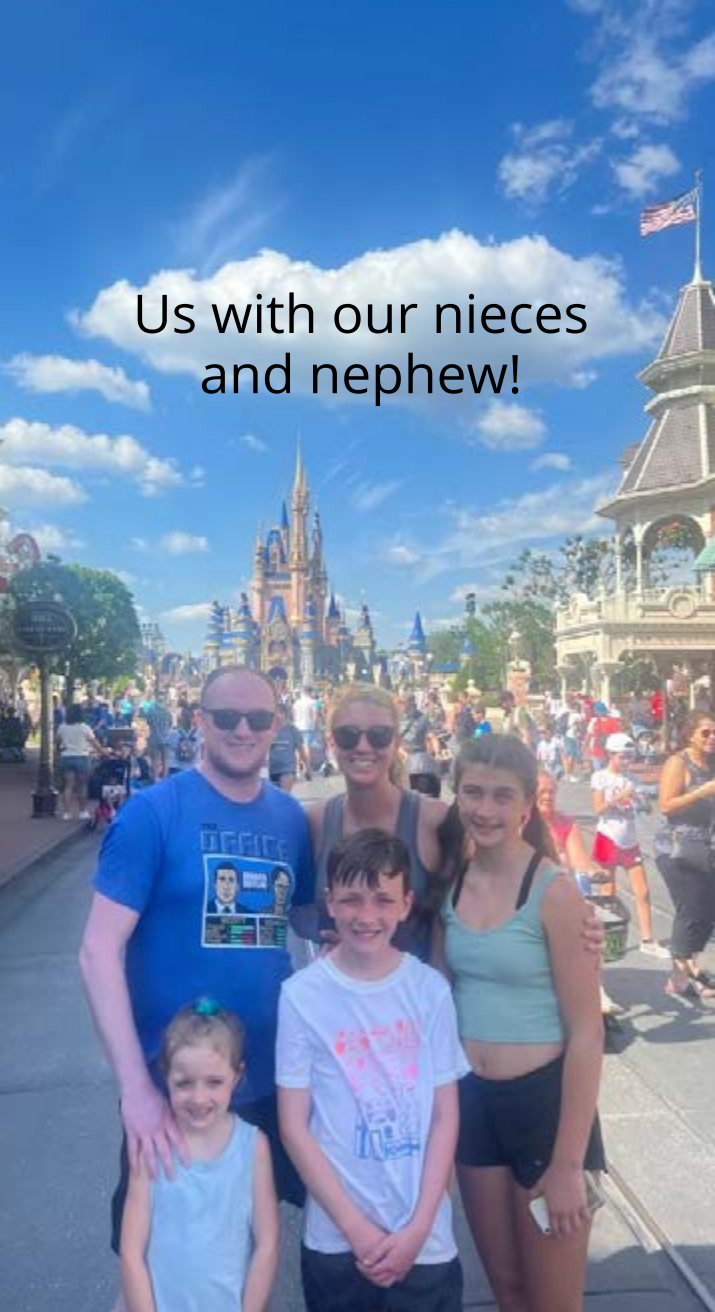
Us with our nieces and nephew!