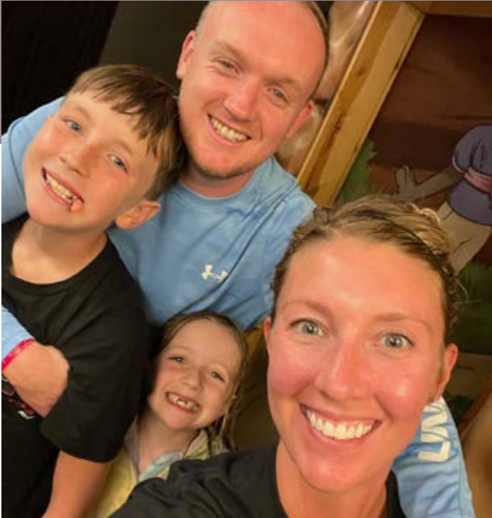
A summer's night at Great Wolf Lodge with our niece & nephew!