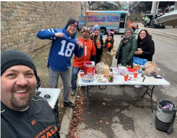
Tailgating with friends before the Colts vs Bengals!