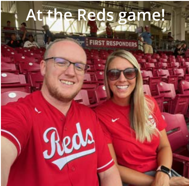
At the Reds game!

My passion is all things sports and I have many sport teams that I root for year-round. My favorite sports are football and soccer (although we call soccer football in England!). I love rooting on my Indianapolis Colts and THE Ohio State Buckeyes. I have learned to appreciate baseball and really enjoy a summers night at Great American Ballpark rooting on the Cincinnati Reds. I love spending time at the golf course playing golf with my dad, my brother-in-law and all of my friends who enjoy golf.