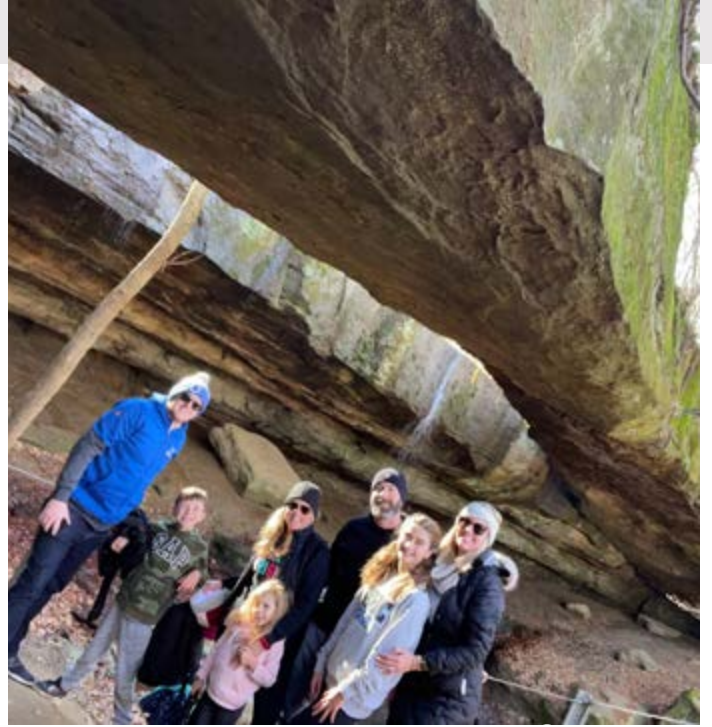
Family hike in Hocking Hills!