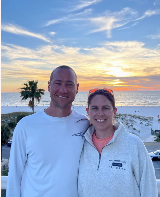
Beachside in Florida