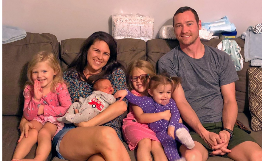
Meeting our Godson for the first time - couldn't leave his sisters out!

We have developed a special faith-filled relationship with our friends and cousins which led them to select us to be the Godparents for their children. We hope to teach our children about God the same way we will support our Godchildren's spiritual journeys. What a honor to hold this role in their lives!