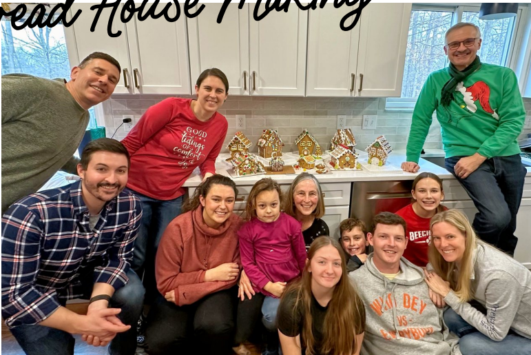
Gingerbread House Making