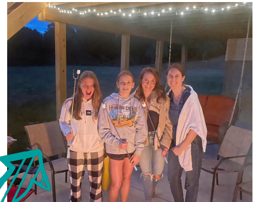
Roasting marshmallows with family on the back patio

Since buying our house in 2020 we have added a back deck, lower patio, and front porch making this our forever home. This spring we look forward to more gardening. We love being able to enjoy entertainment in nearby cities such as going to the zoo, aquarium, parks, and hiking trails but nothing is better than spending time at home with family! A favorite moment is sitting outside listening to the fountains in the nearby lakes.