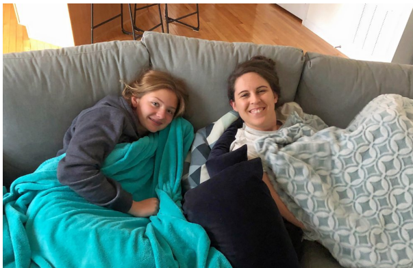
Cousins watching movies together