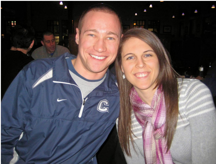
Early friendship in 2012