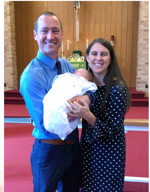
We traveled to Colorado for our Godson's Baptism weekend and shared a group pic with his parents and cousin.