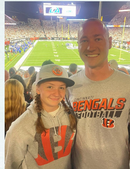
Cousins enjoying Monday night football