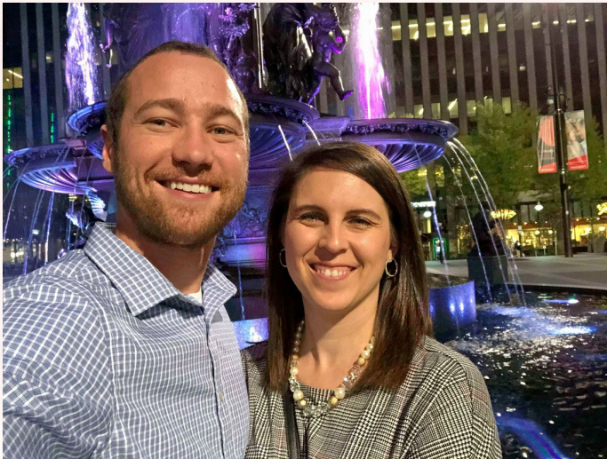
Dinner out in downtown Cincinnati