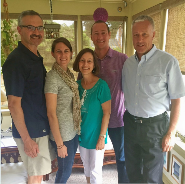
Joint family meet up in Boston