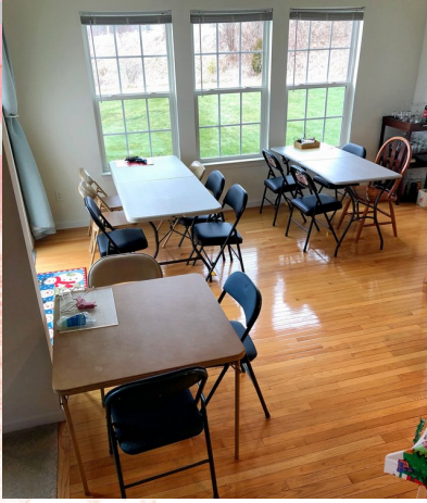
Setting up the kitchen for a crafting party