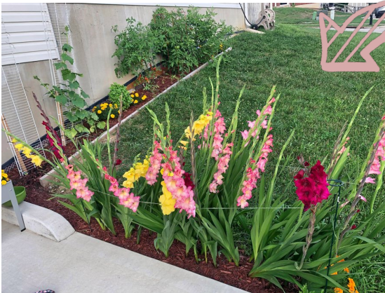
Growing cucumbers, tomatoes, herbs, and flowers in the side yard