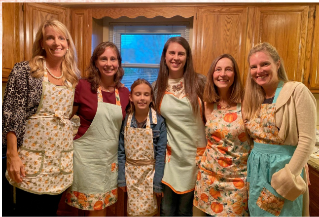
Wearing matching aprons on Thanksgiving. We sewed these ourselves!