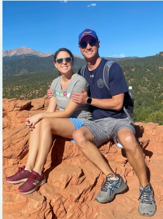
Exploring the Colorado Rockies