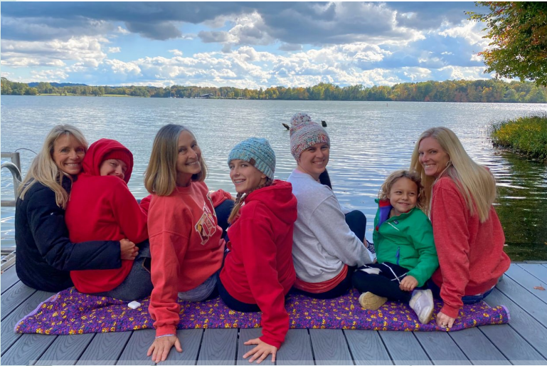
We walk the hiking trail down to the lake to enjoy the view.