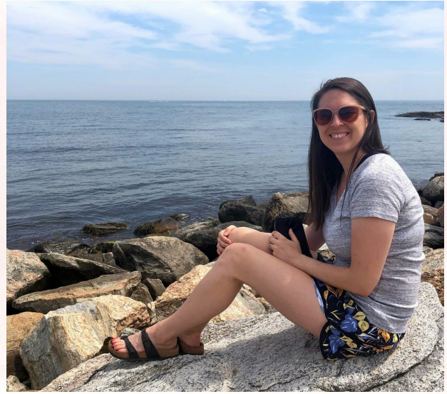
Experiencing rocky beaches in Connecticut