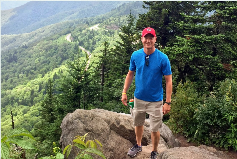
Hiking the mountains in North Carolina