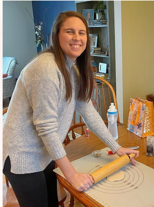
Rolling out dough for homemade dumplings