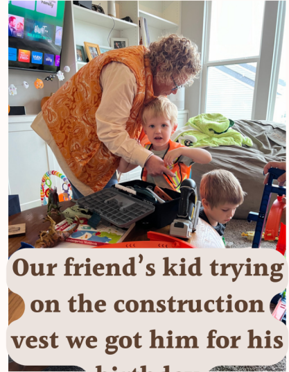
Our friend's kid trying on the construction vest we got him for his birthday