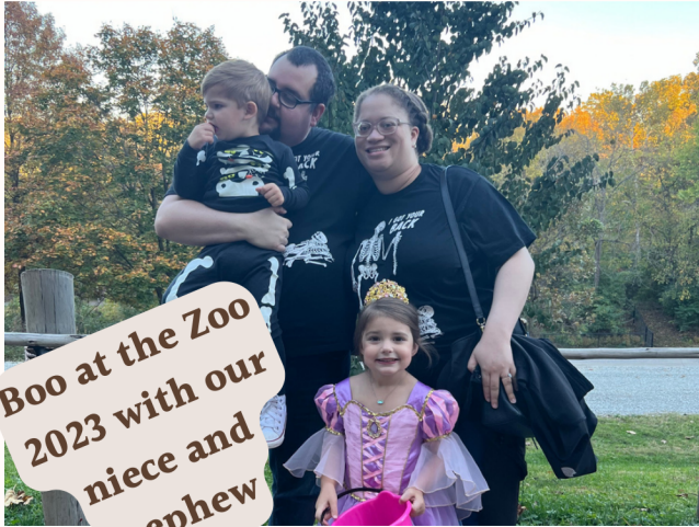
Boo at the Zoo 2023 with our niece and nephew