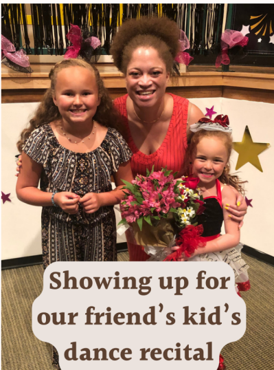
Showing up for our friend's kid's dance recital