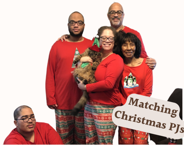
Matching Christmas PJs