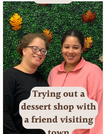
Trying out a dessert shop with a friend visiting town