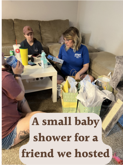
A small baby shower for a friend we hosted