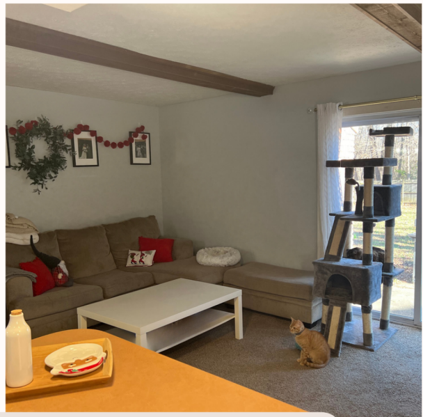
Here is our nursery, backyard, kitchen, and living room.