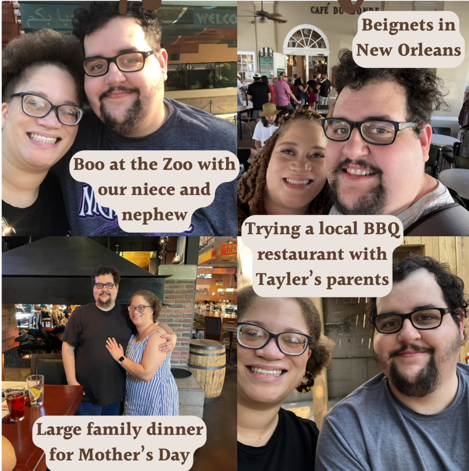
Beignets in New Orleans