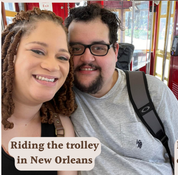
Riding the trolley in New Orleans