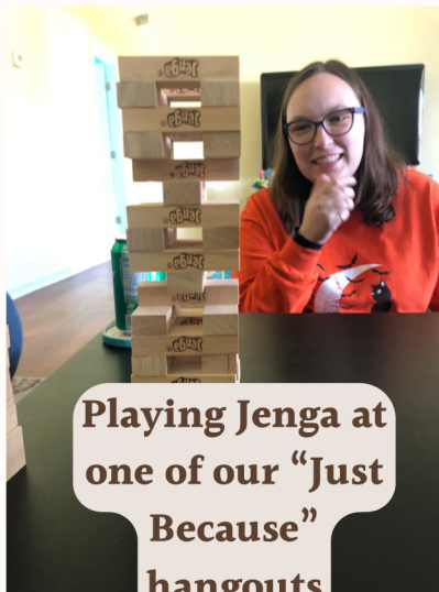
Playing Jenga at one of our "Just Because" hangouts