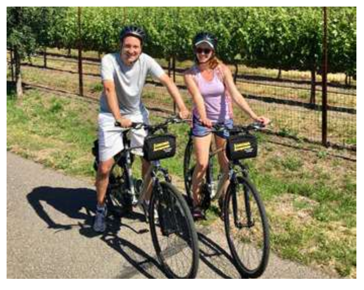
Biking in Sonoma Valley, CA