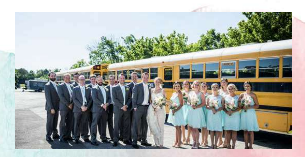
Our Amazing Wedding Party