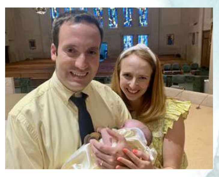
Celebrating becoming Godparents