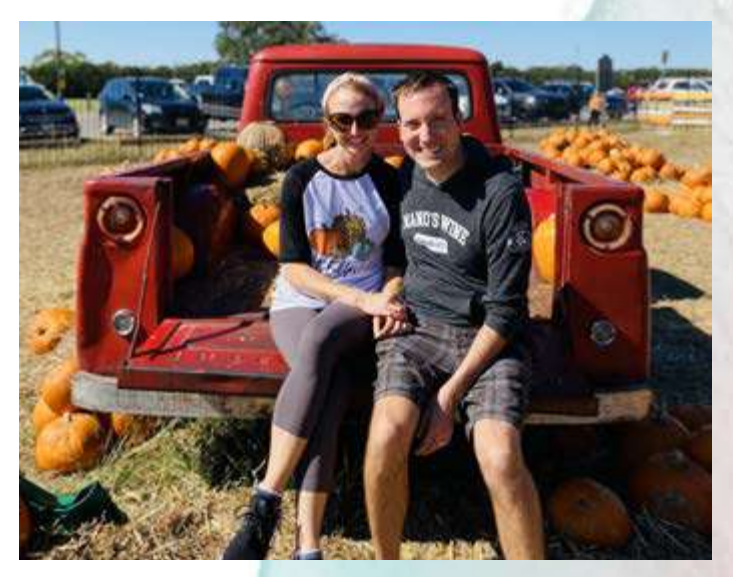
Visiting the Pumpkin Patch

With both of us having weekends and summers off, we enjoy doing lots of fun things around town such as: getting ice cream, riding bikes, playing golf and putt-putt, board game nights, working on fun projects, going to the pool, taking walks, hiking, and going to the park. We also enjoy running in 5K runs to support good causes. To celebrate the seasons we like to go to the pumpkin patch, Festival of Lights at the Zoo, and the annual butterfly exhibit at the local conservatory. We look forward to sharing these fun experiences with our children and doing things like coloring with sidewalk chalk, blowing bubbles, swingning on the playset, playing hide-and-go-seek, baking cookies, reading stories, movie nights, and making crafts. We can't wait for these special times to come!