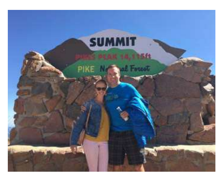
We made it to the top of Pike's Peak National Forest