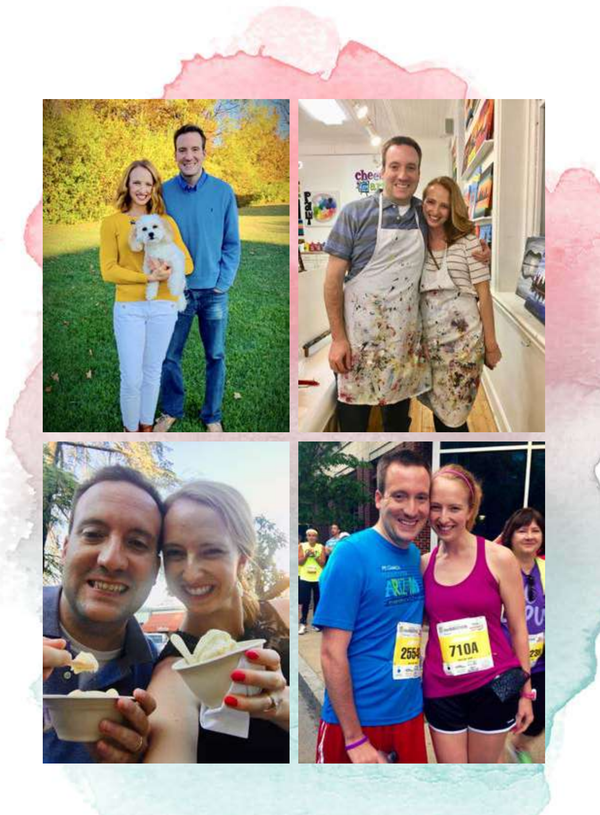
Fun Times We Share