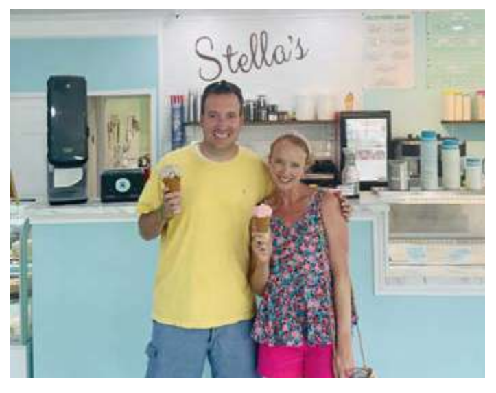
Getting ice cream is one of our favorite outings!