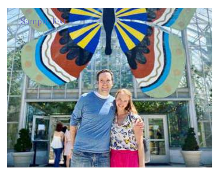
Enjoying the annual Butterfly Show