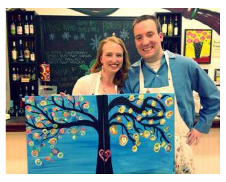
Painting Date Night