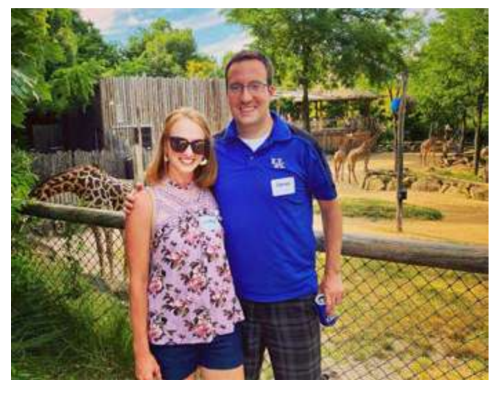
Fun at the Cincinnati Zoo