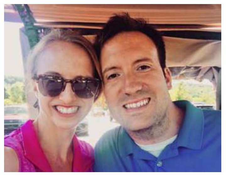
Golfing together in the Summer Sun