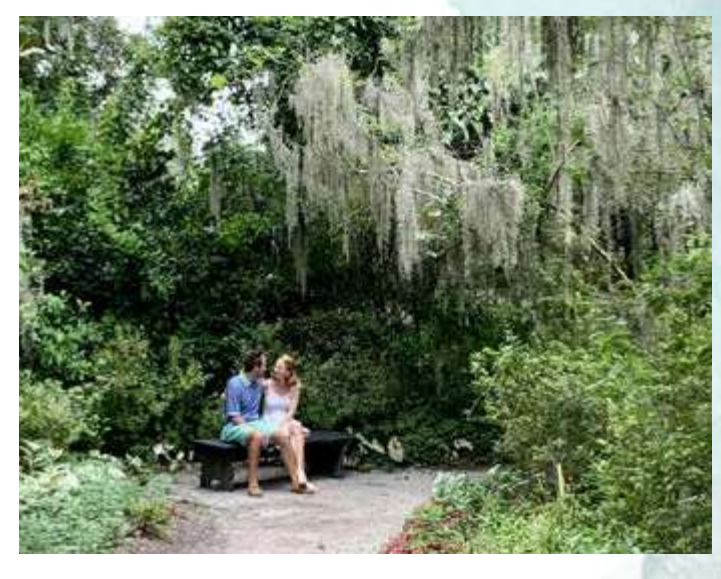
Enjoying the beauty of the Magnolia Plantation in SC