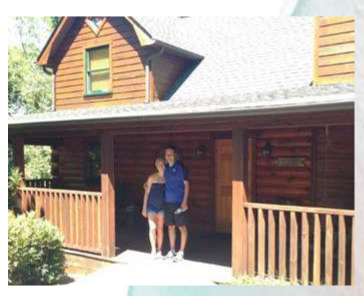
Family Hiking trip in Gatlinburg, TN