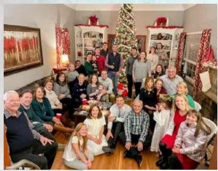
We spend Christmastime with immediate and extended family each year