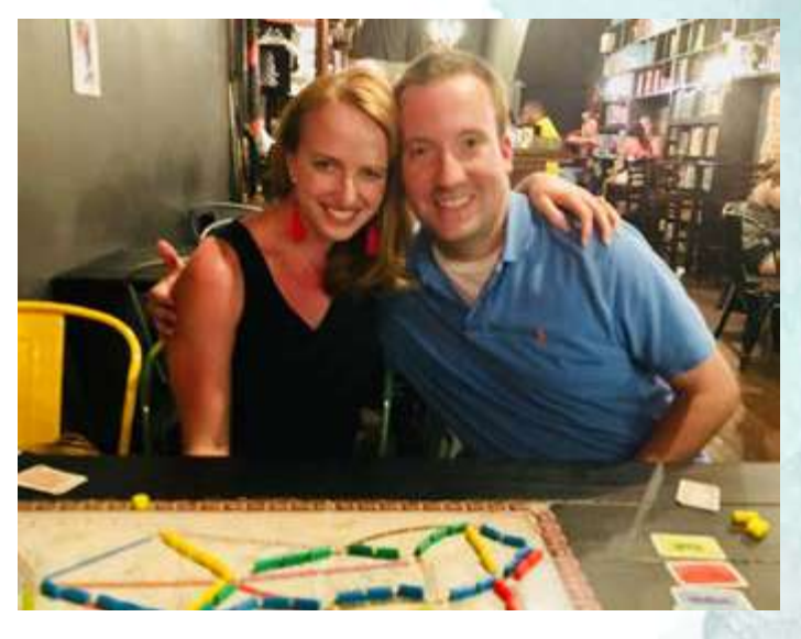
Playing Board Games Together