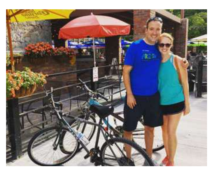
Bike ride trip to a favorite local trail