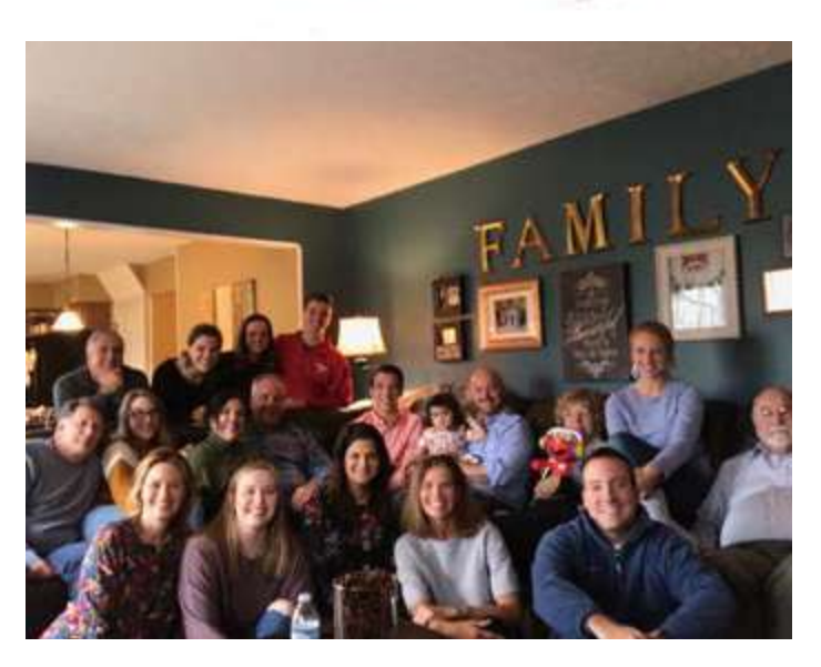
Extended family time to celebrate birthdays