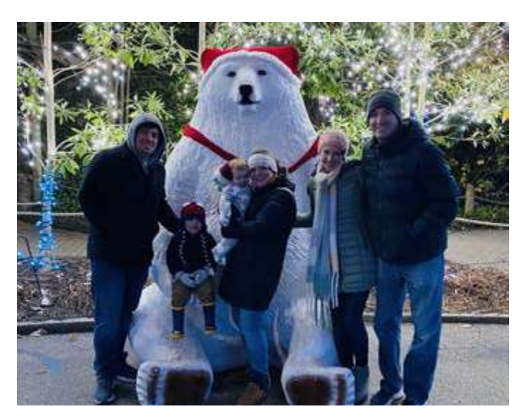
Friends trip to the Cincinnati Zoo