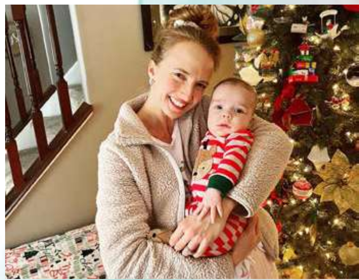
Spending time with nieces and nephews at Christmas