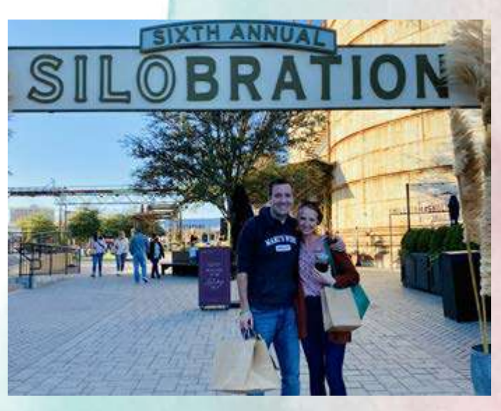
Visiting Waco, TX