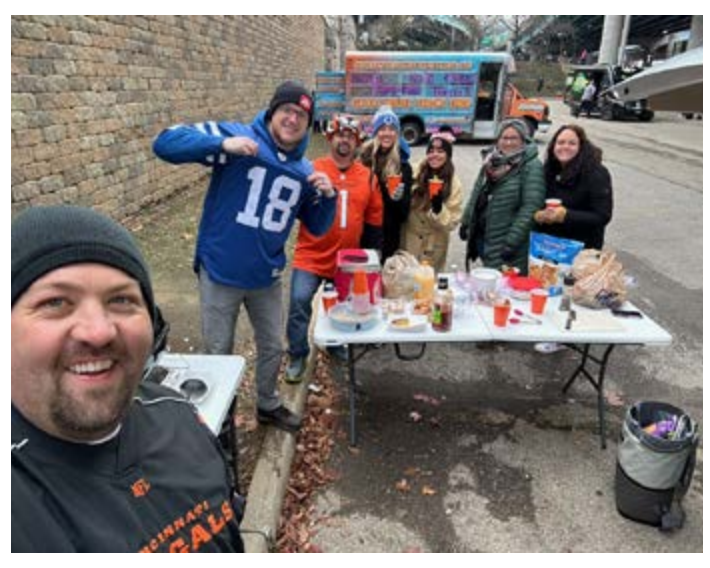
Tailgating with friends before the Colts vs Bengals!