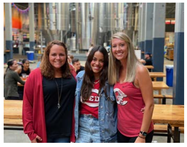
On our way to the Reds game!

"Family is family, whether it's the one you start out with the one you end up with, or the family you gain along the way."