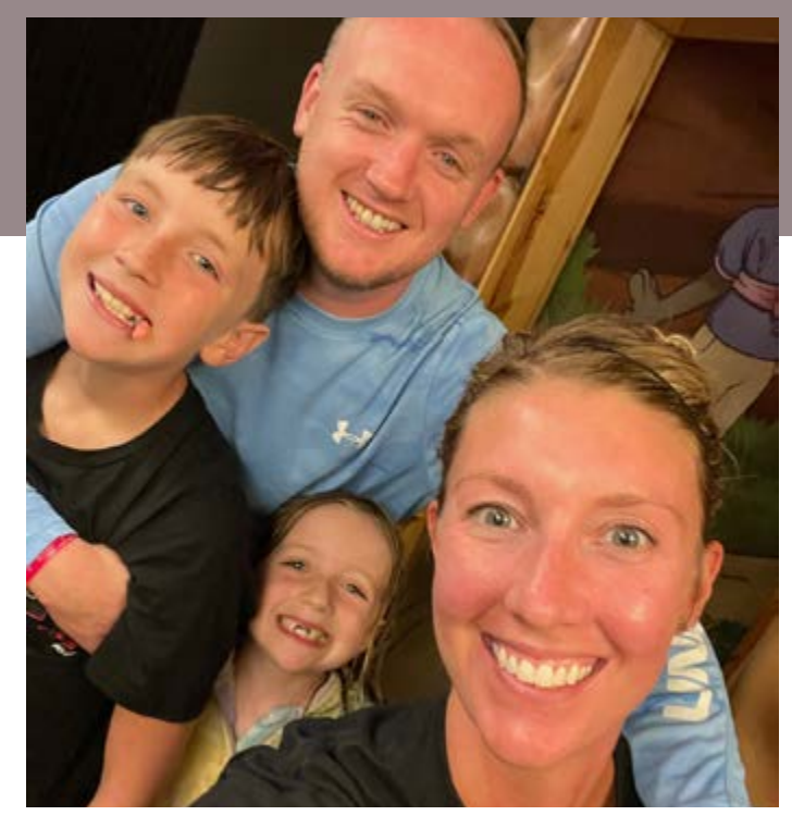
A summer's night at Great Wolf Lodge with our niece & nepthew!