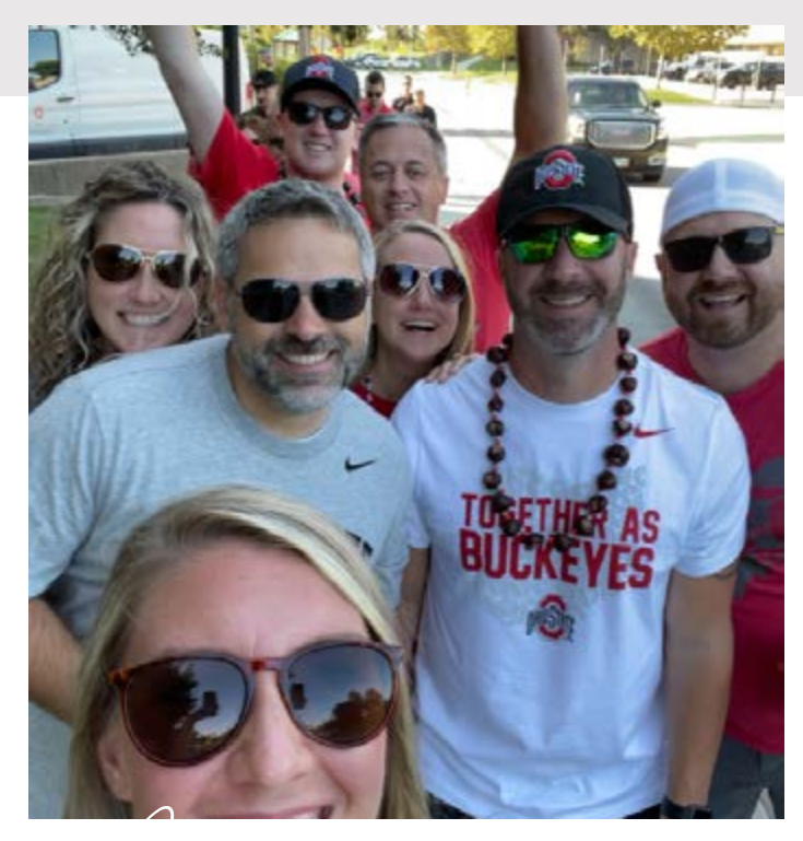
Going to the Buckeye game with friends and family!